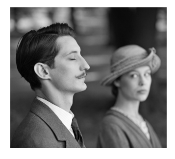
Oct. 12: Frantz

Director: François Ozon; France/Germany 2016; German; 113 min.